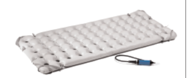
SAM 35 PAD two-way hand pump sold separately